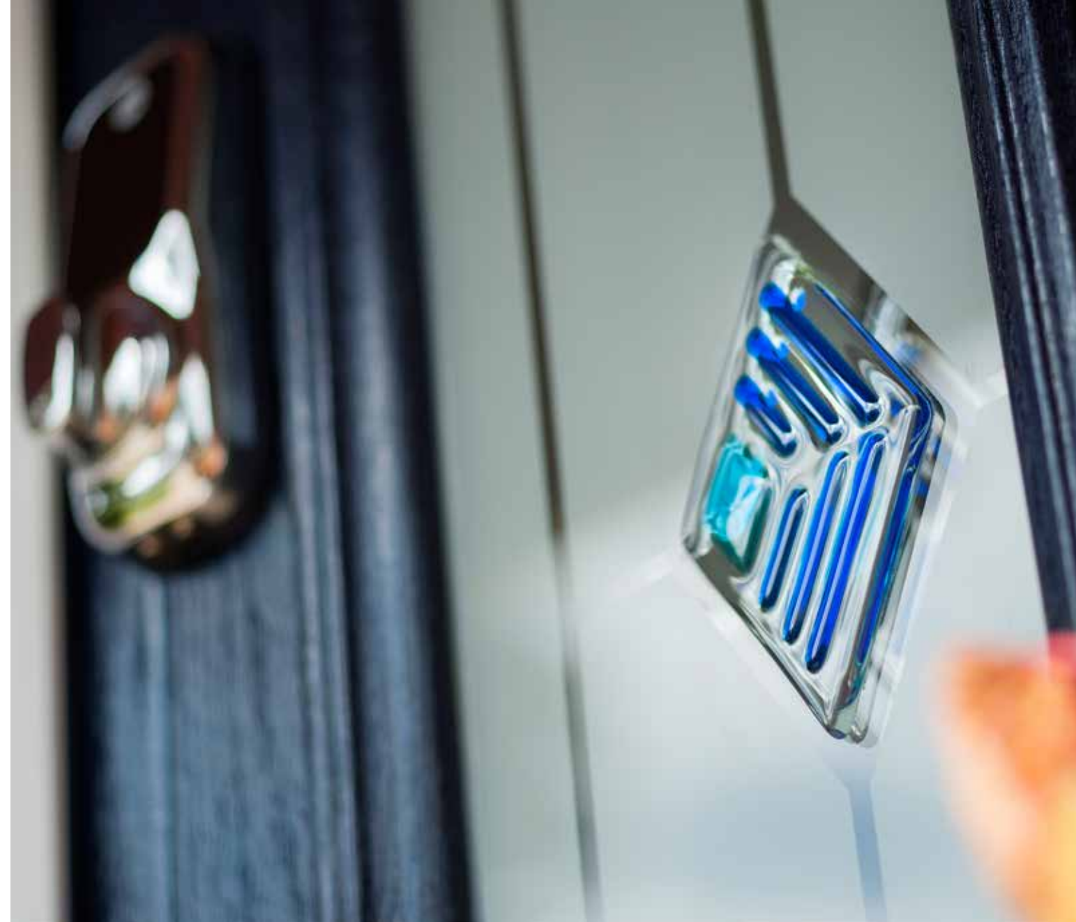
Twin side in Blue with Murano (blue) glass