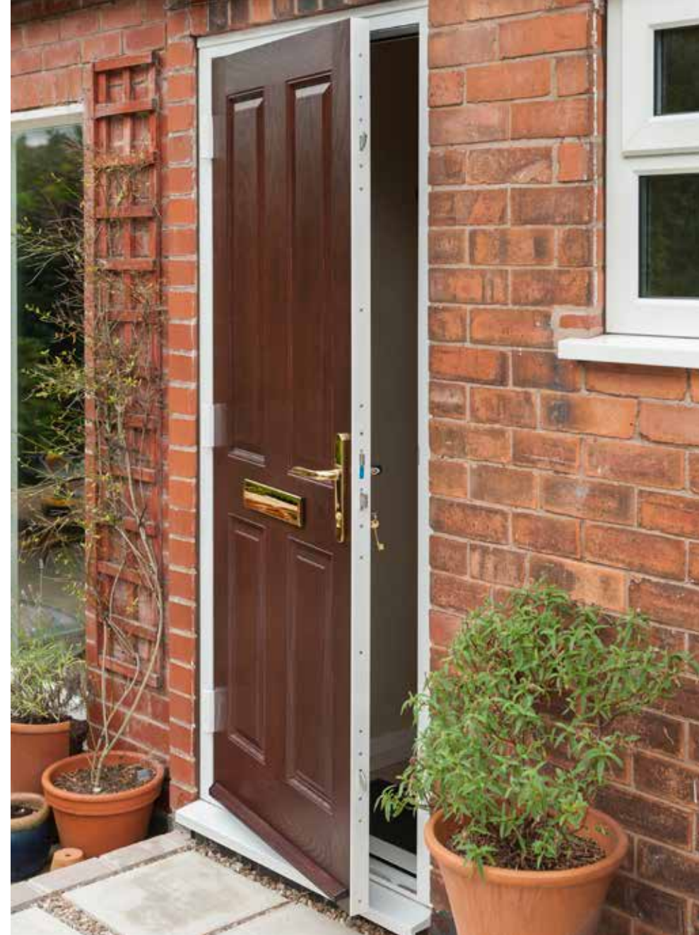
4 panel in Darkwood and low frame threshold