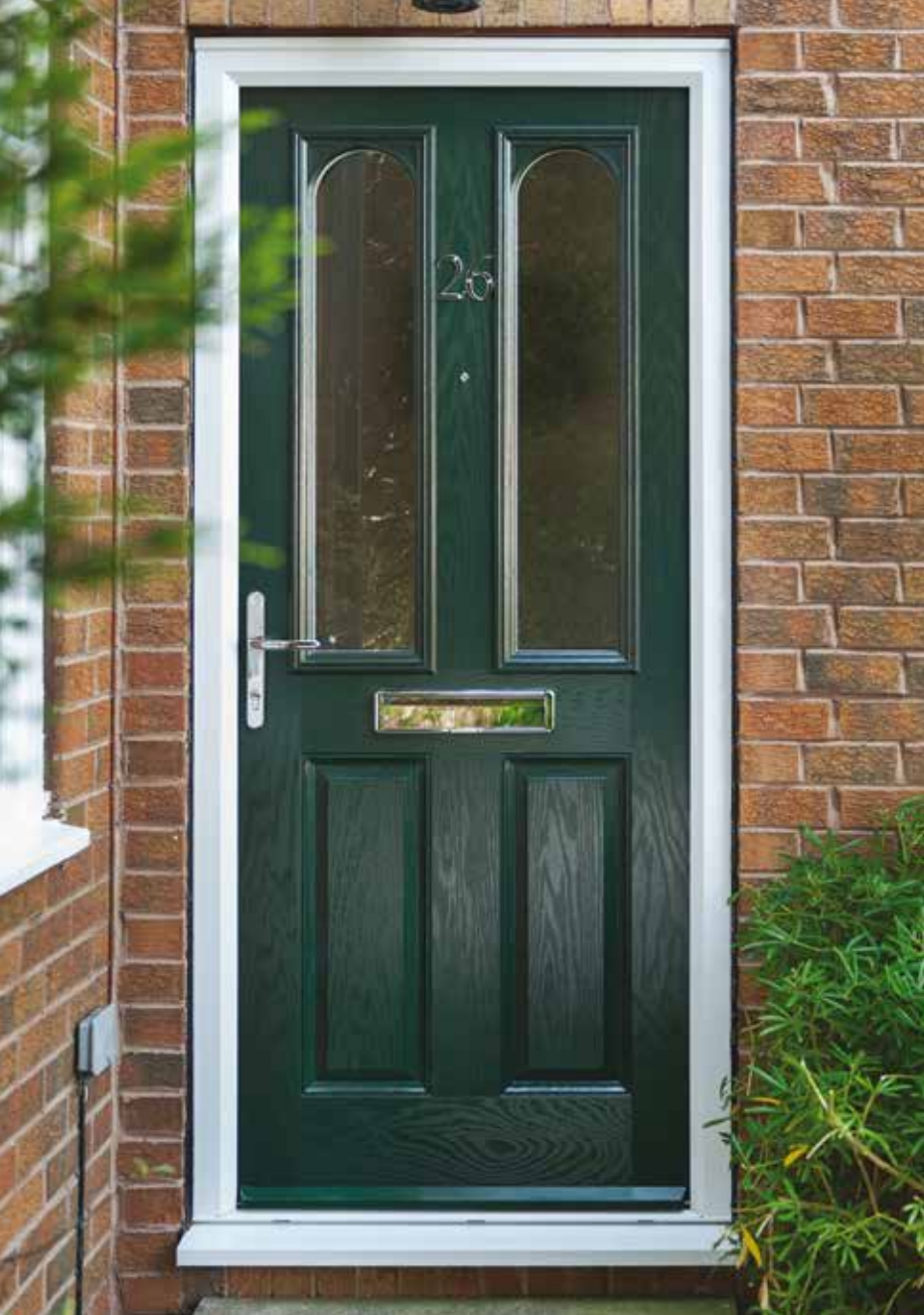
2 panel 2 arch