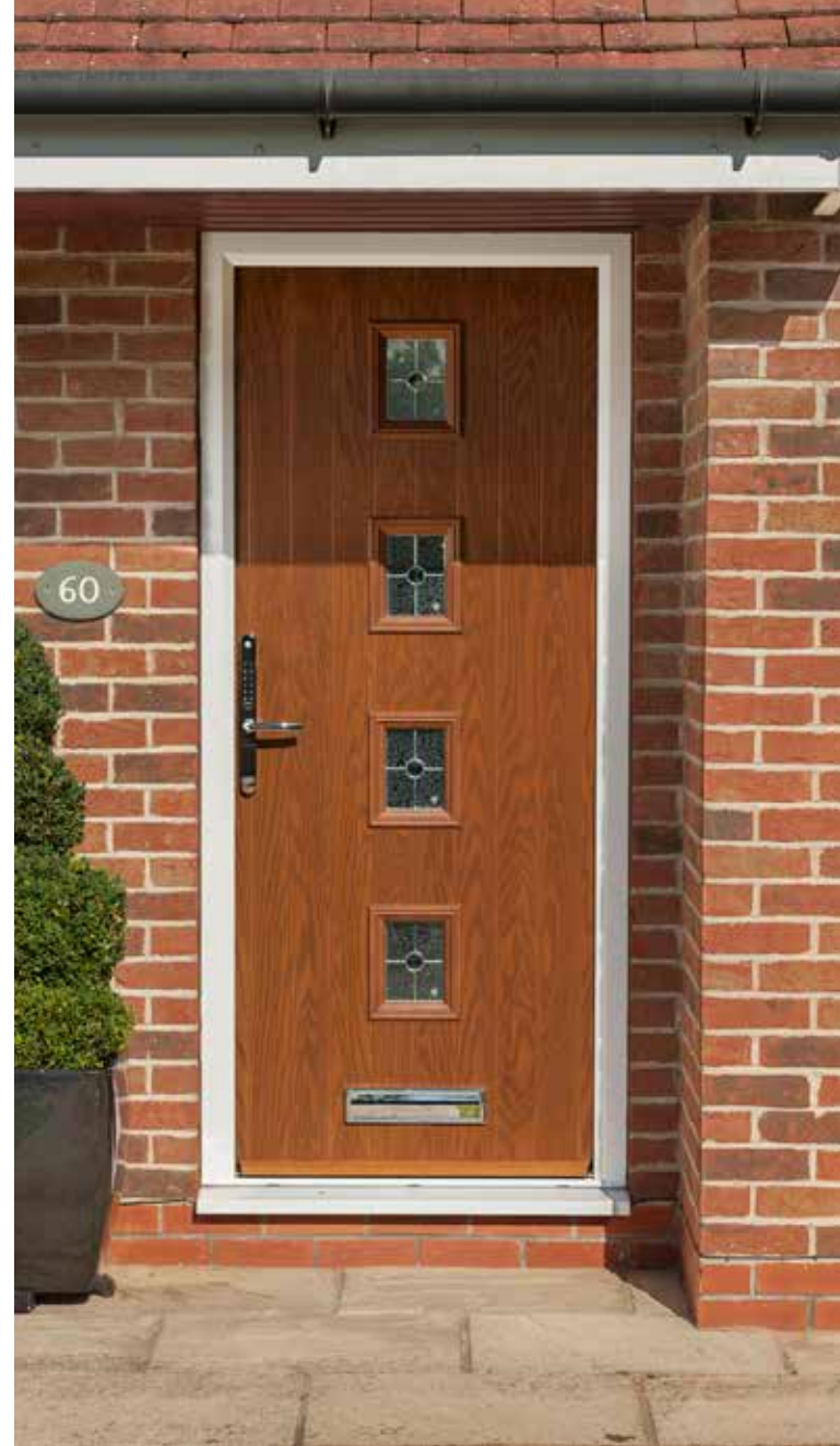
4 square in Oak with Finesse glass and Yale Keyfree handle