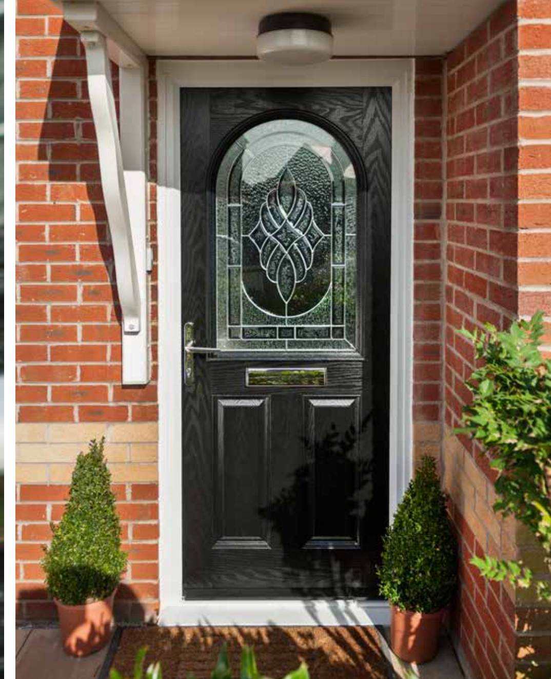
2 panel 1 arch