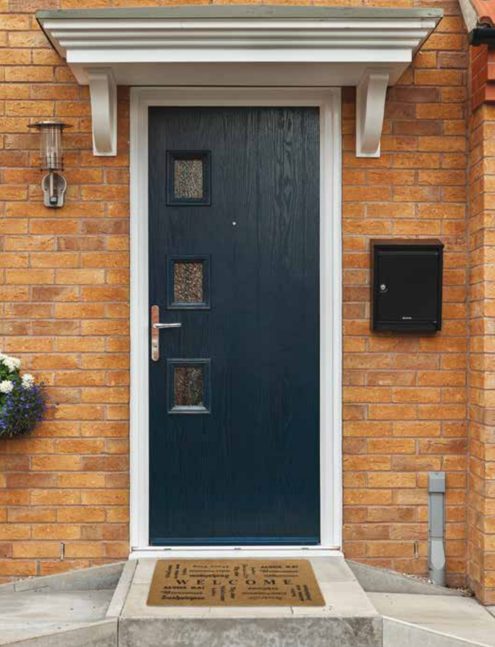
3 square in Blue with Minster™ glass