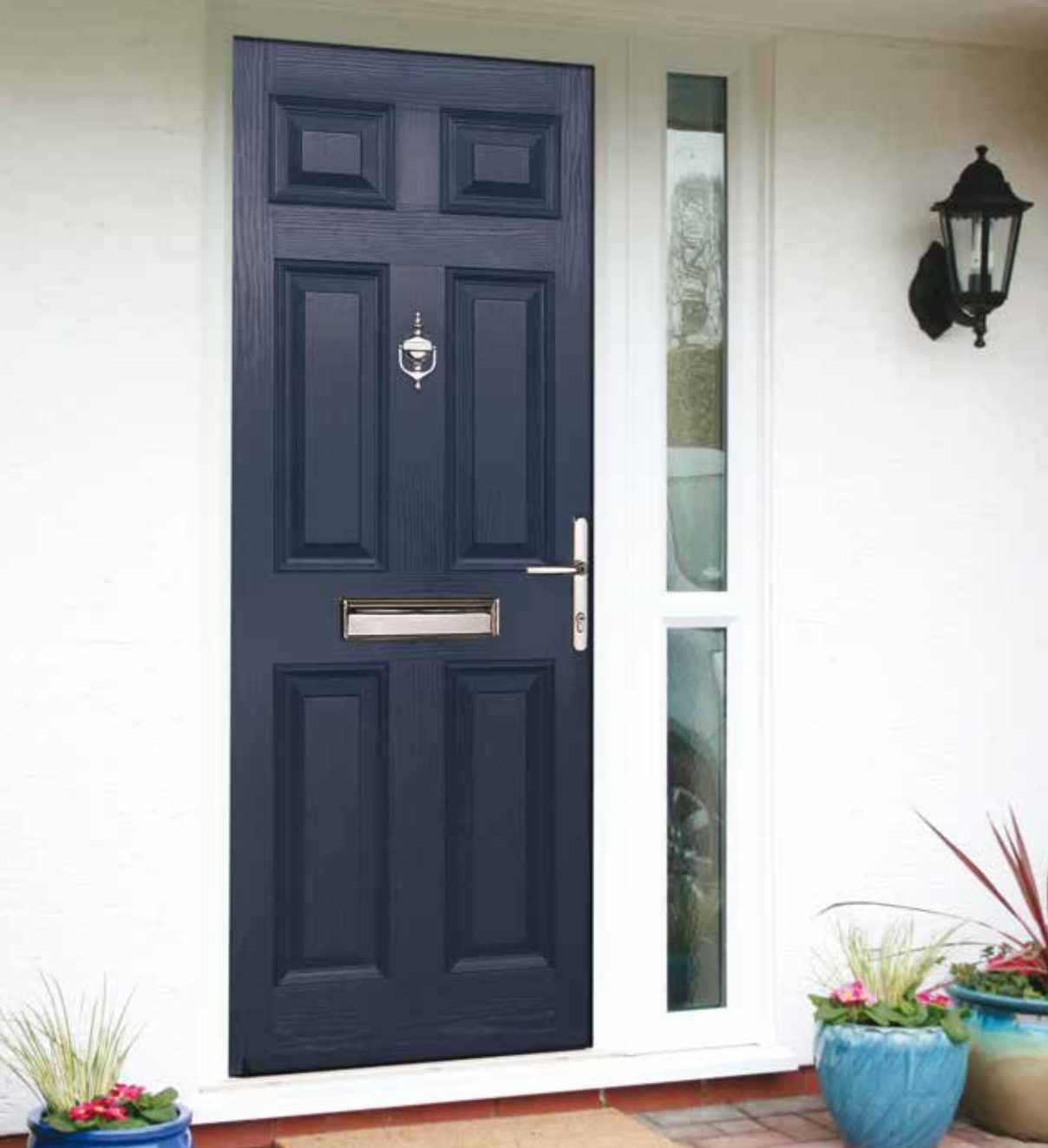
6 panel in Blue with a glazed side panel