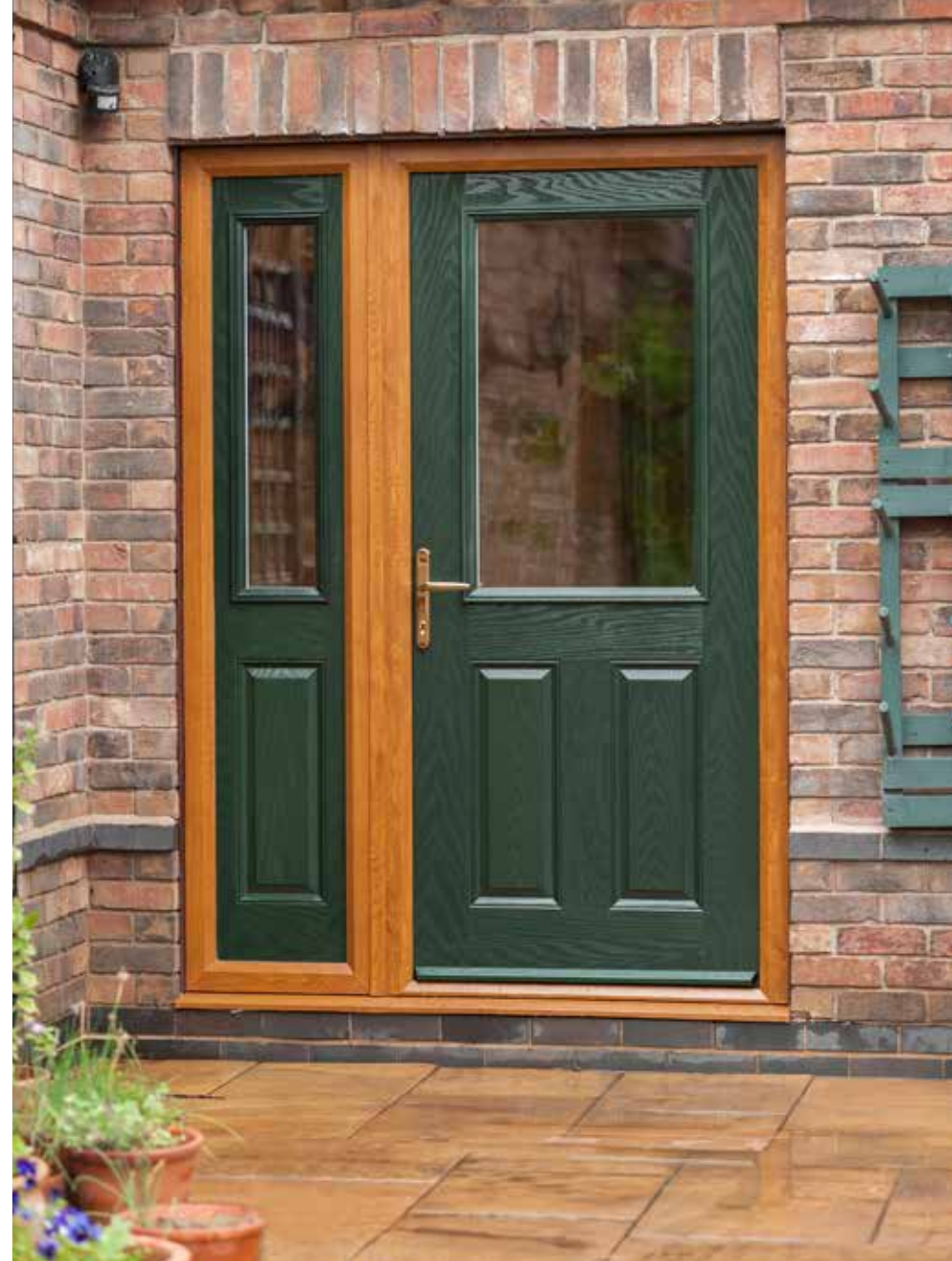
2 panel 1 square

in Green with clear glass in an Oak foiled outer frame